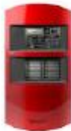
Fire Alarm System