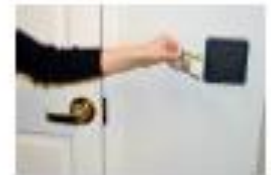
Excess Card Entry