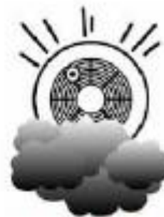
Fire Smoke Detector